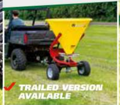
TRAILED VERSION AVAILABLE

The Wessex FS-360-P is a mounted spreader with a polypropylene non-corrosive hopper, and it's an excellent addition to any fleet of groundcare equipment.